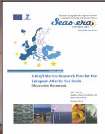
Discussion Document (2011)