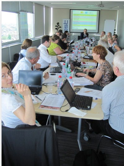
SEAS-ERA Task 1.1 – Final inventory meeting, Brussels, 24 May 2011